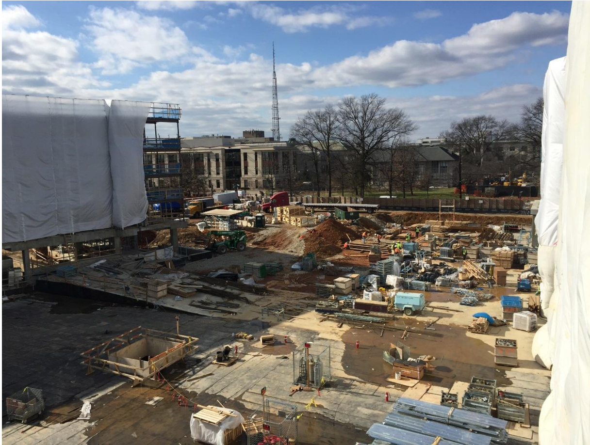
Courtyard view from Building 3