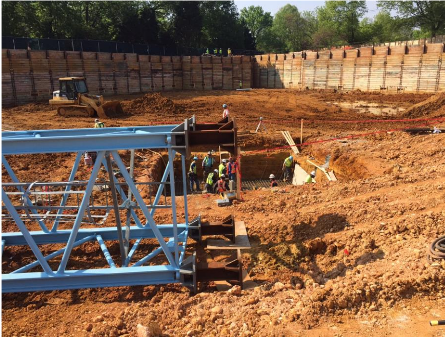
Tower Crane Installation