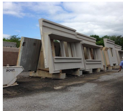
Off-site Façade Pre-fabrication