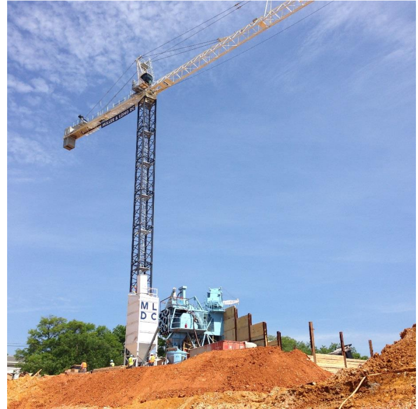
Concrete Batch Plant