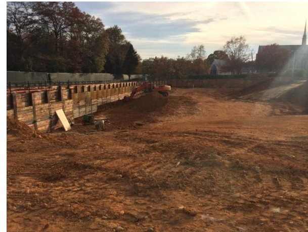
Lagging and excavation