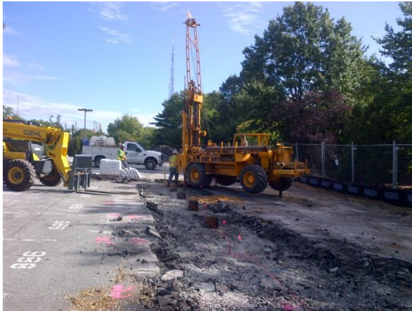
Dewatering well installation