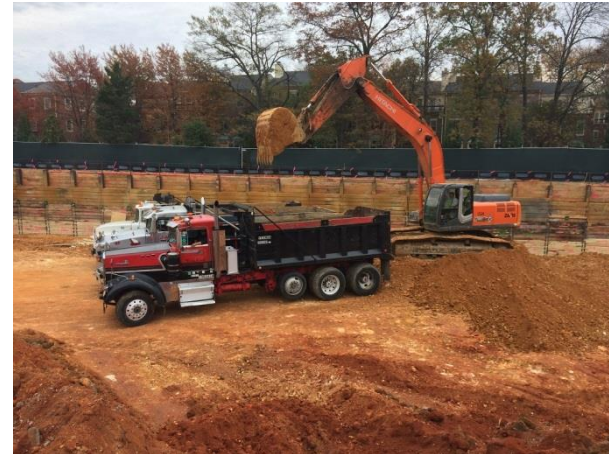
Lagging and excavation