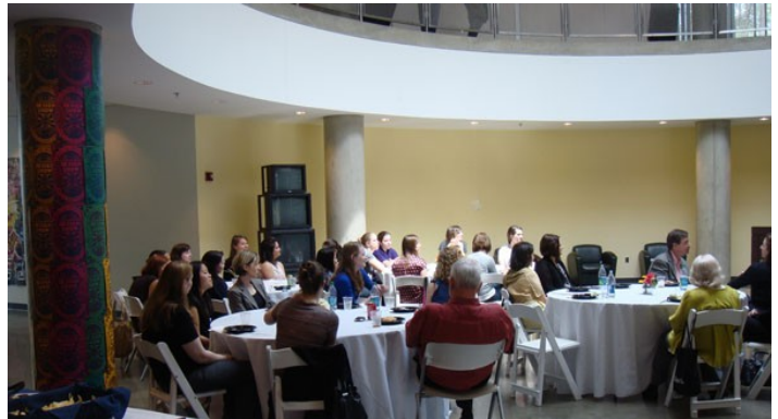
Students, faculty, staff and benefactors gather in the Katzen Arts Center for the annual art history spring luncheon.