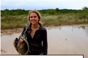
Field work in Costa Rica

The Global Environmental Politics program focuses on the global challenges of environmental protection and sustainability. Housed within American University's School of International Service, the program's mission is to