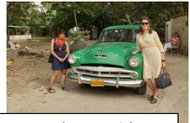
Travel course to Cuba

GEP's internationally renowned faculty works at the cutting edge of these issues through research, partnerships with Washington-based and international organizations, and civic engagement. Our core faculty (see bios pp. 3-4) and affiliates across the AU campus form one of the strongest teaching and research teams of its kind in the world. Small classes, accessible faculty, and student involvement in faculty research and policy initiatives characterize the program's learning environment.