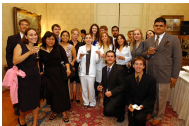
A final group shot at the Closing Reception (Mexican Cultural Institute).