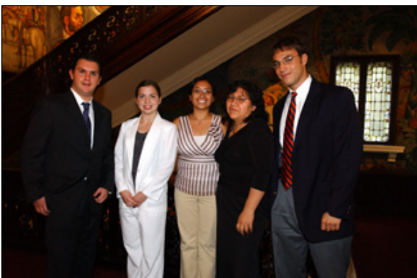
Summer Institute participants enjoy their Closing Reception.