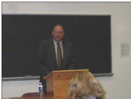
The Honorable Thomas Shannon explains the role of the National Security Council.