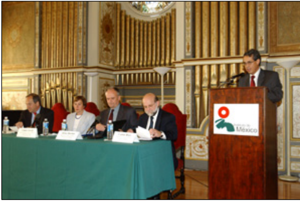
Task Force Presentation Panel at the Mexican Cultural Institute .