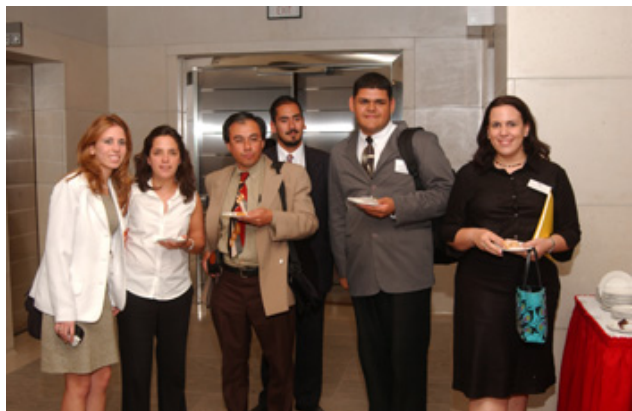
Enjoying the Opening Reception at the Canadian Embassy.