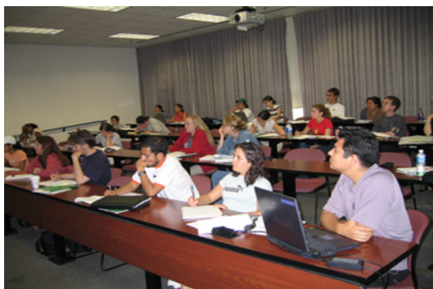
A typical day in class (Ward Circle Building).