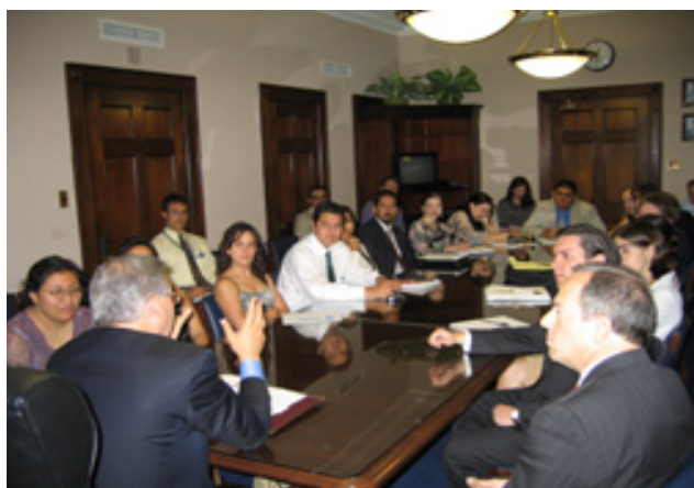
Learning the role of Congress in North American Issues with the Honorable Robert Menendez (Capitol Hill).