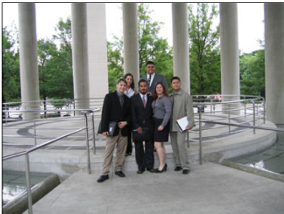
Students outside the Canadian Embassy, Opening Reception.