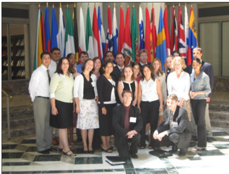
Off-campus lecture at the Inter-American Development Bank, June 30, 2004.