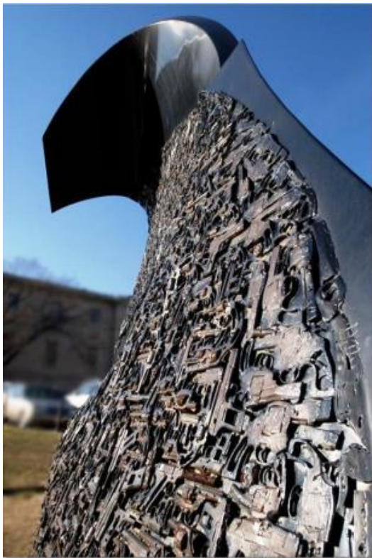
Guns into Plowshares, Washington DC