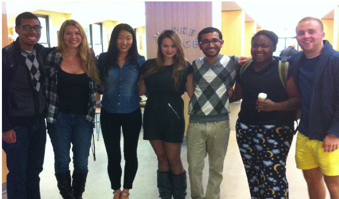
A buddy family gets together for brunch.

The Leadership Program encourages students to be active members in their communities. The photos below are snapshots of the action Leadership students are engaged in every day. SPALeaders from all grades challenge themselves and their peers to be socially active citizens .