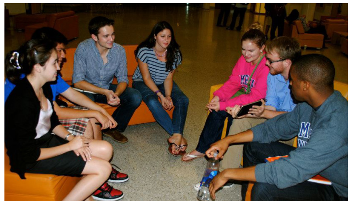
The Publicity Committee gathers to discuss ideas for the newsletter.