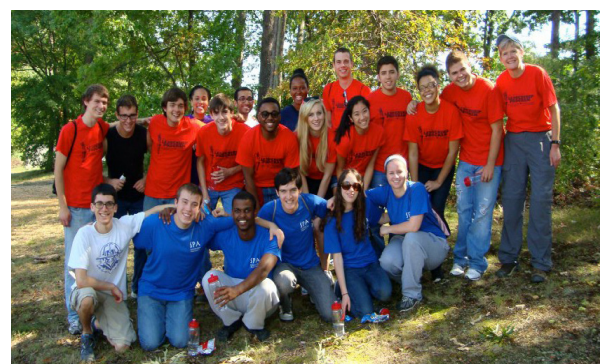
Members of the Leadership Program after finishing the clean-up.