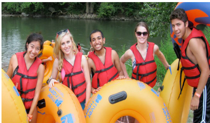
Freshmen enjoy river tubing on their retreat.