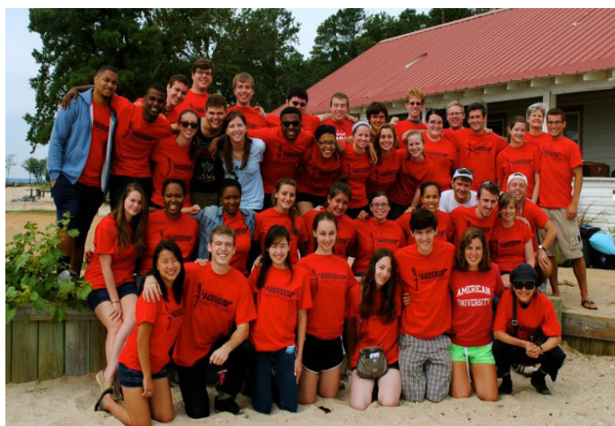
The Class of 2015 gathers on the beach on the last day of retreat.