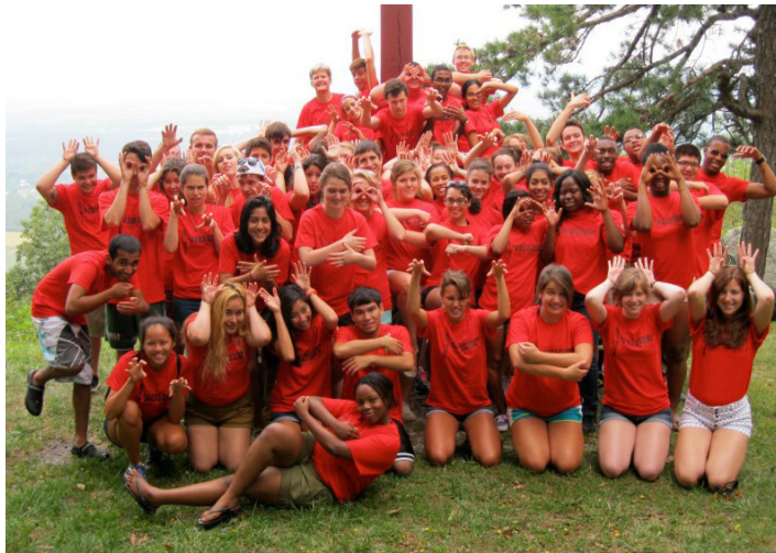
The Class of 2016 flashes their animal symbols for the camera.

As exciting as the first two weeks of classes can be, the transcendental retreat to Jefferson, Maryland served as a time for students to reflect on what they're thankful for, their personal values, and how excited they are for the year to come.