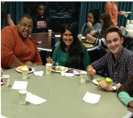
Freshmen eat at the Linner.