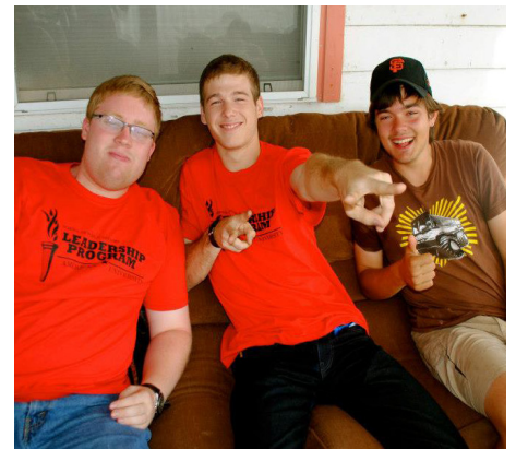
SPALeaders relax on the sophomore retreat.