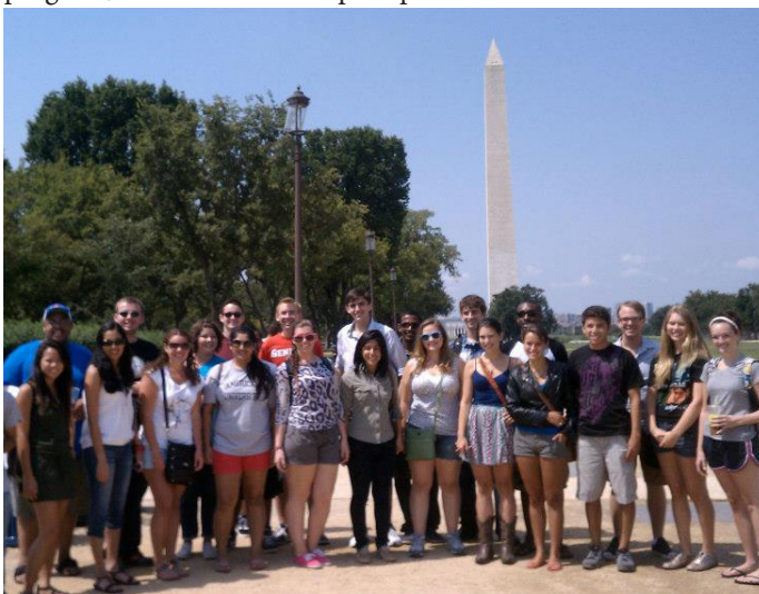
The Class of 2016 gathers in front of the Washington Monument.