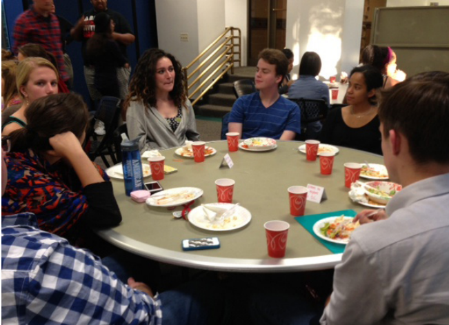
Students talk about the reality of college over spaghetti!