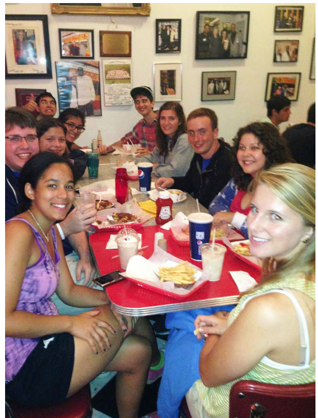
Students grab some famous DC eats at Ben's Chili Bowl after some amazing Welcome Week activities!