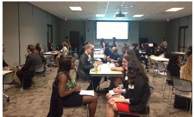
Sophomores meet DC professionals at the Mentorship Reception!