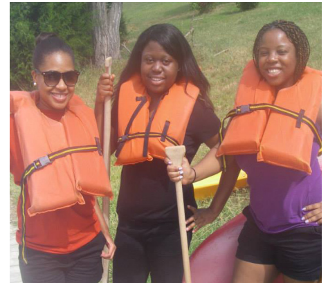
Safety first for canoeing on Sophomore Retreat!