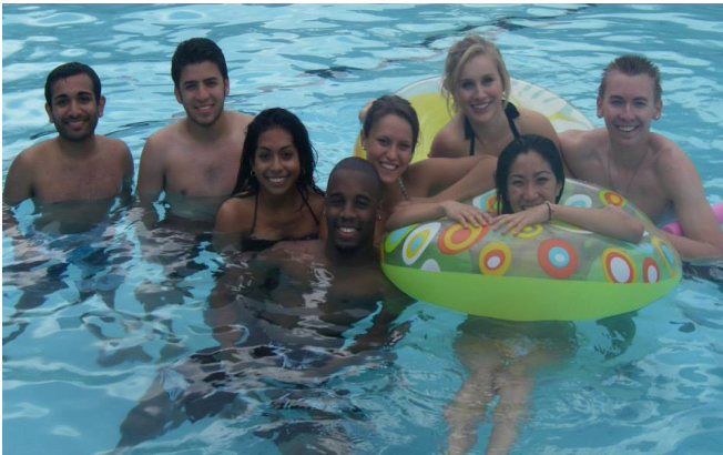
Sophomores strike a pose in the pool on retreat!

The Leadership Program encourages students to be active members in their communities. The photos below are snapshots of the action Leadership students are engaged in every day. SPA Leaders from all grades challenge themselves and their peers to be socially active citizens .