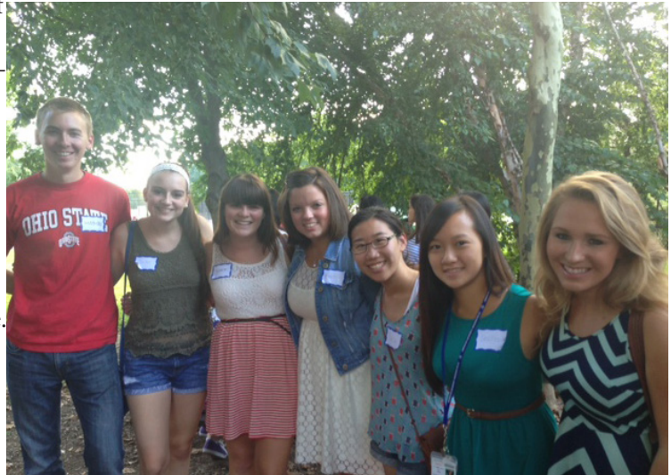
Students of all ages strike a pose at the annual BBQ!

dance, the BBQ offered a grand opening to the freshmen class, and brought returning members together again after a summer apart. Students left with a renewed sense of