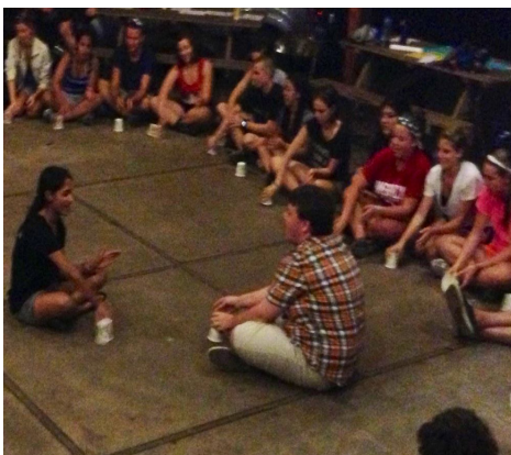
Teambuilding on Freshman Retreat!