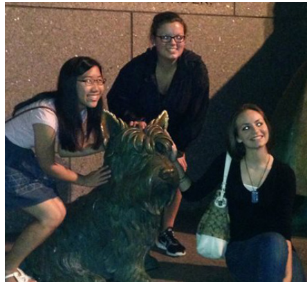
The Class of 2017 explores DC for their Welcome Week Scavenger Hunt!