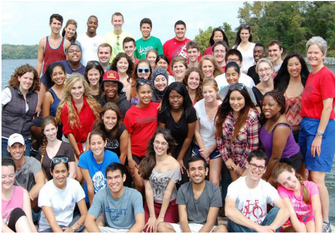
The Class of 2016 gathers on the dock for a picture!