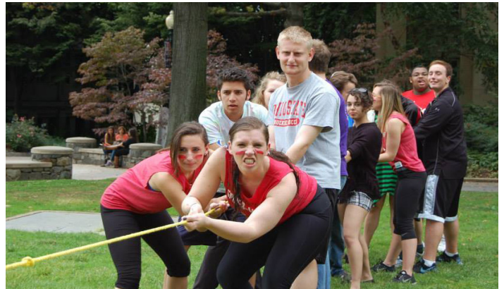
Students get intense during the Tug-o-War at Buddy Olympics!