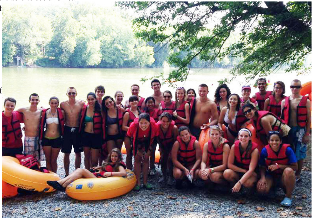
The Class of 2017 finishes up their retreat with some tubing down the Shenandoah River!