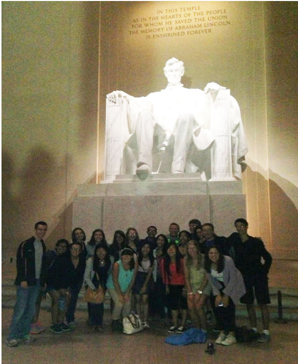
The Class of 2017 poses in front of the Lincoln Monument

The Program welcomed the Leadership Class of 2017 with a whole slew of Welcome Week events, from a picnic on the National Mall to a scavenger hunt around campus and fro-yo in Bethesda. These events provided the new students a week full of Leadership bonding.