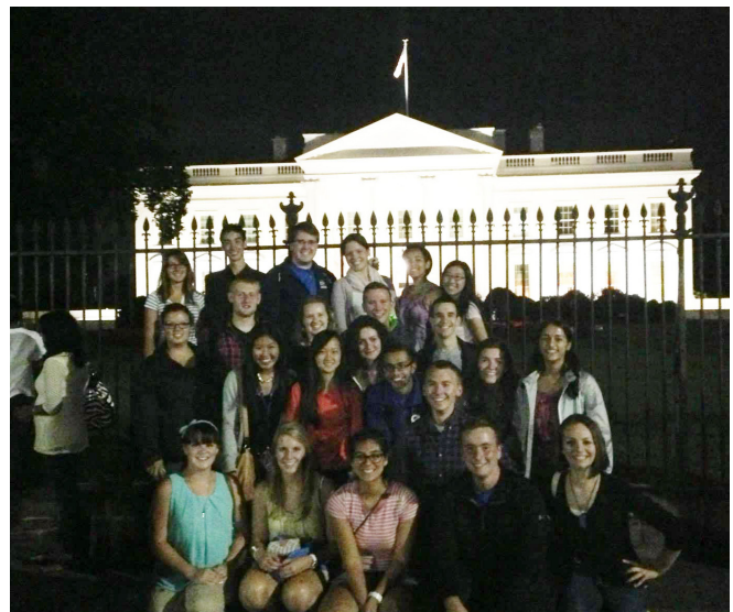
The Class of 2017 smiling at the White House!