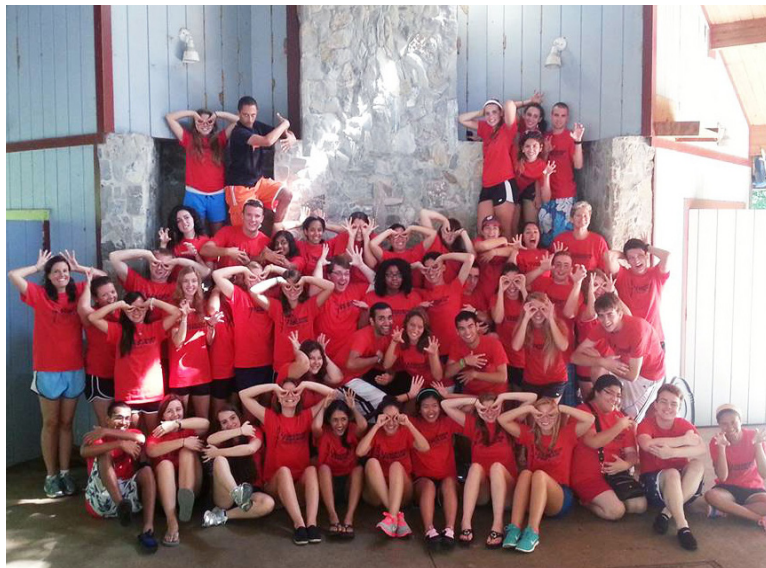
The Class of 2017 shows off their animal signs on retreat!

the start of classes provided a forum for older students to offer the first-years advice on how to adjust to life at American University. It also offered proof to the entering class that they can find a home in the Leadership community while at American as they continue to acclimate to life in college.