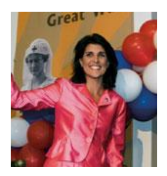
Nikki Haley

favor abortion rights, and has supported most of the 13 Democratic senators and 56 Democratic House members who make up the vast majority of the women now in Congress. (There are now three women governors from each party.)