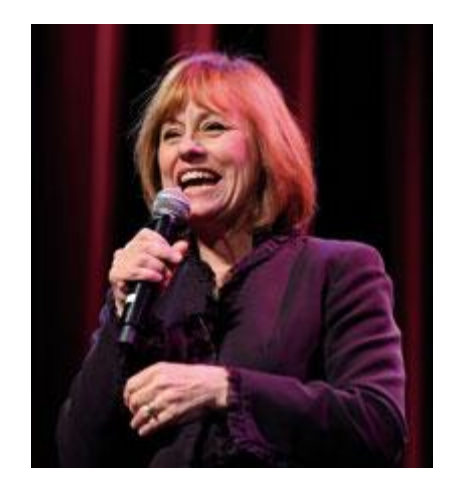
Sharron Angle

The problem is that a minority of the Republican woman who ran for the House this year won the party nomination, and far fewer still are genuinely competitive candidates for the fall elections. An analysis by the Center for American Women and Politics shows that 101 non-incumbent Republican women ran for the House in the 42 states that have already held primaries, with 74 losing in the primaries and 20 nominated in districts where the Democratic candidates are reliably safe bets to win.