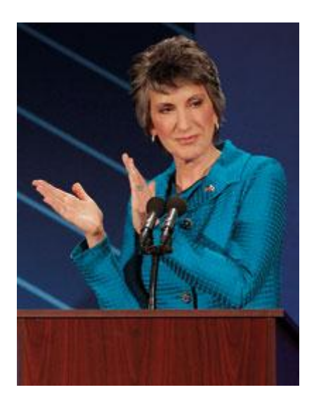
Carly Fiornia

Murkowski's loss also has an important impact on the world of gender politics. It provides the latest and most damaging rebuttal to expectations that 2010 would be remembered politically as the Year of the Woman II — or at least as the Republican Year of the Woman, a counterpart to the historic and mostly Democratic surge of women winners in 1992.