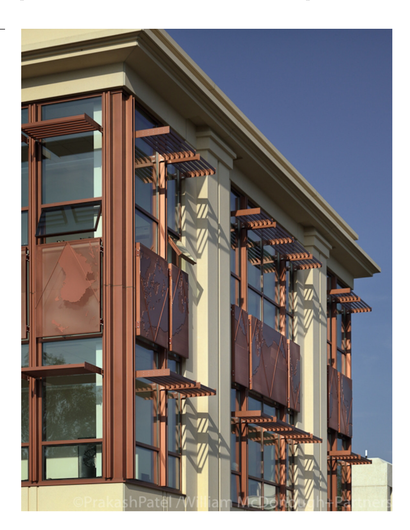
Journal of Green Building

FIGURE 2. Corner detail of "Bucky" panels.