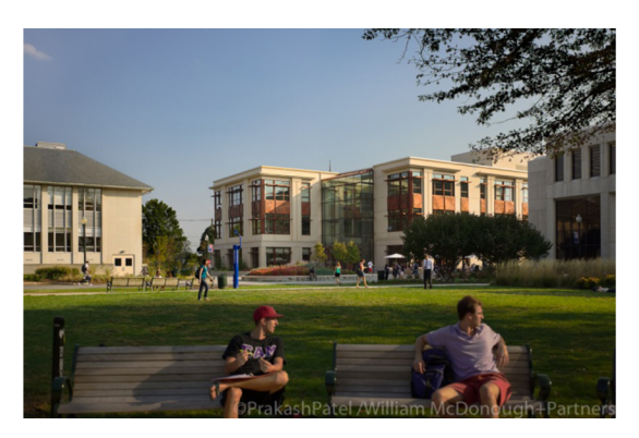
FIGURE 1. School of International Service at the Quad.

place to dream," and two, it had to be as sustainable as the budget would allow, the very minimum being LEED Silver, soon to be an American University standard.