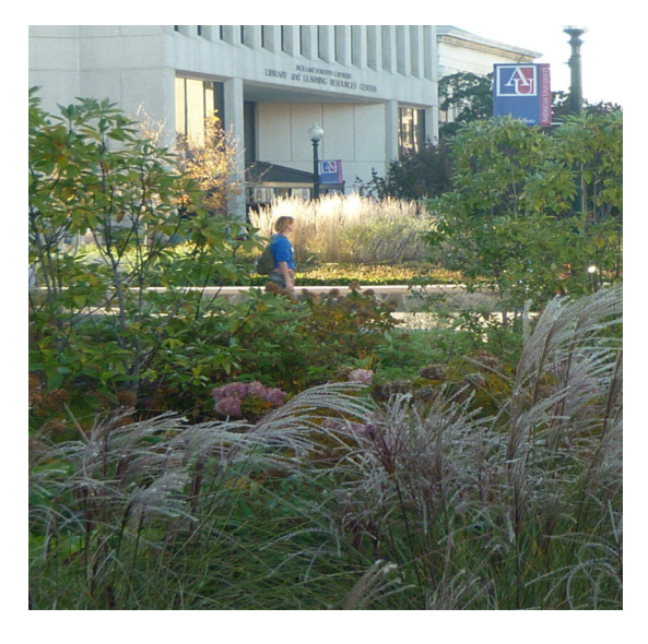
FIGURE 7. Looking across the parking roof at Nebraska Ave.