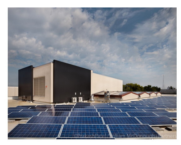
FIGURE 3. Solar PVs and Solar Transpiration.

which acted like a simplified vertical solar panel, was a new and untested idea and only a few people in the DC area really knew how it worked. What everyone thought would be perforated black collector panels turned out to be a solid, thin vertical element on the penthouse wall that absorbed heat and made the air passing behind it warm enough to reduce the cost of starting the heating cycle every day during the winter. We held several meetings with the solar consultant and the sub-contractor to coordinate and expedite the installation. This was a first for all of us, so we examined and re-examined every detail.