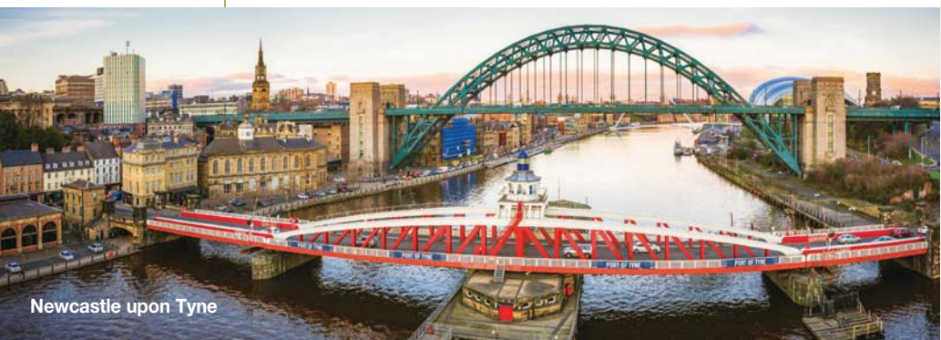
Newcastle upon Tyne

Oceania Cruises may modify the cruise itinerary up to and during the voyage. Air arrangements, cruise accommodations, local transportation, and optional shore excursions are arranged by Oceania Cruises, which may use other suppliers or providers to render the services. The agreement in this brochure is the exclusive and entire statement of the agreement between you and Go Next Inc. It should be read carefully.