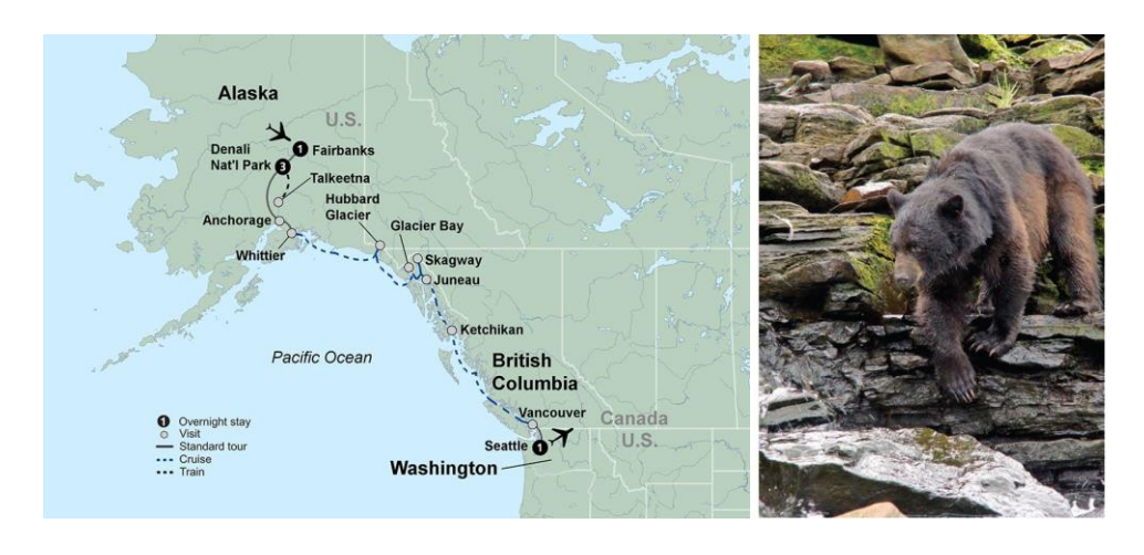
13 Days ● 25 Meals: 11 Breakfasts, 6 Lunches, 8 Dinners

Inside Cabin Rates: Double $4,589 ; Single $7,589;