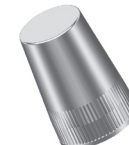
Shield caps p/n 7713011