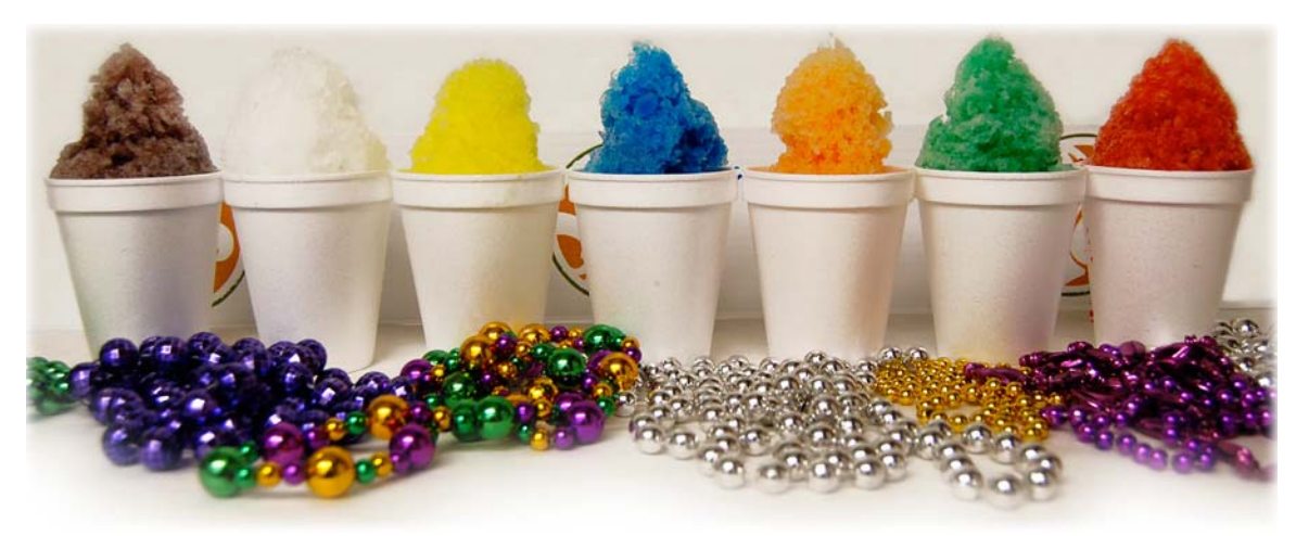
New Orleans Snowballs are pre-approved for ingestion!

As service-learners, our time in New Orleans will demand 100% presence and energy. Please do not jeopardize neither the well-being of the group and yourself, nor our optimal contribution at the service sites.