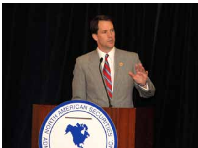
Rep. Jim Himes (D-CT) gives the Keynote Address during NASAA's Public Policy Conference.