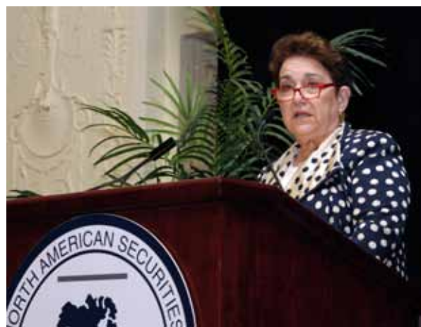
SEC Commissioner Elisse Walter speaks on the need for increased examination of investment advisors and the challenges ahead.