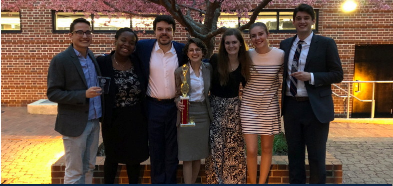
The American University Mock Trial team holding a trophy.