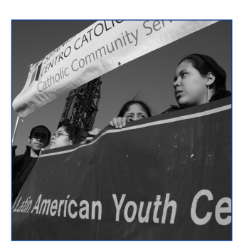
FACULTY GUIDE TO SERVICE-LEARNING

Community Service Center Mary Graydon Center, Room 273